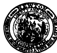
Setti D. Warren Mayor

1164 Centre Street, Newton Center, MA 02459-1584 Chief: (617) 796-2210 Fire Prevention: (617) 796-2230 FAX: (617) 796-2211 EMERGENCY: 911